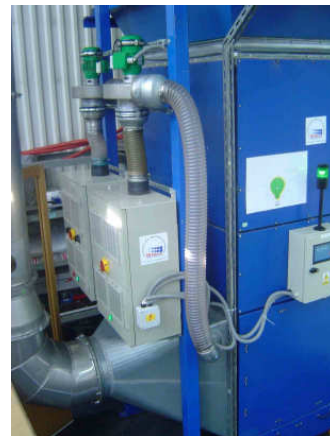
Odour control in chemical plants