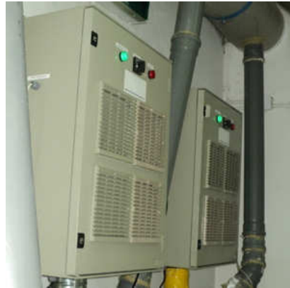
Odour control in restaurant kitchens