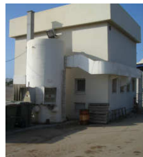
Odour control in waste treatment plants